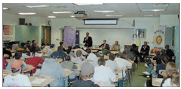
Program started at Glenbrook North High School in 2002 - 8 straight years - 2 days - 8 Classes - 400 students - over 4,000 students since inception