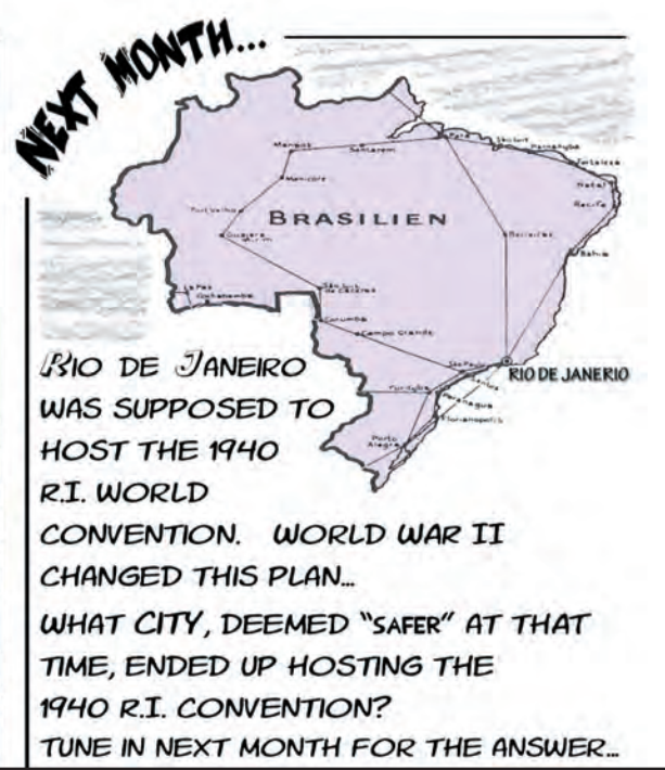
Do you have some favorite rotary related trivia you'd like to contribute? Send it to: aaron uinnovate.net